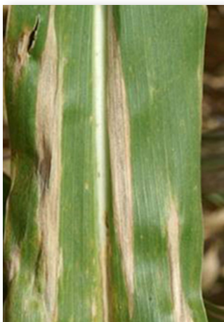
Northern leaf blight