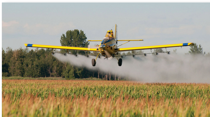
Full tassel fungicide application