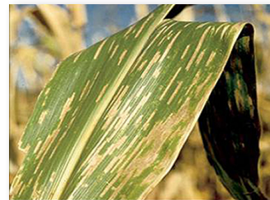
Gray leaf spot

Given the positive yield responses and improved harvestability, applying fungicides at the full tassel to brown silk stage is a good recommendation for all hybrids. But some growers may be looking to focus on input costs and only plan to apply fungicide to a portion of their acres. There are different ways to decide which acres to focus your treatment on.