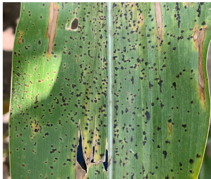
Tar spot on leaf

Two weather variables have been helpful in predicting where tar spot will set in. Normal to above normal June rainfall is one of those variables favoring disease development. Moisture during June provides humid conditions in the canopy that allow the disease to get established. The second weather variable is July and August rainfall. Rainfall or humid conditions later in the season are needed to continue disease spread and intensity. More severe tar spot years have resulted when wet Junes have coupled with above normal July-August rainfall.